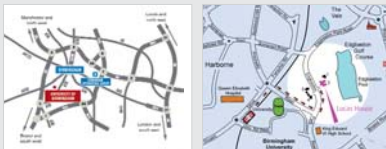
LOCATION OF LUCAS HOUSE, UNIVERSITY OF BIRMINGHAM CONFERENCE PARK

Can technology help the vulnerable road user?